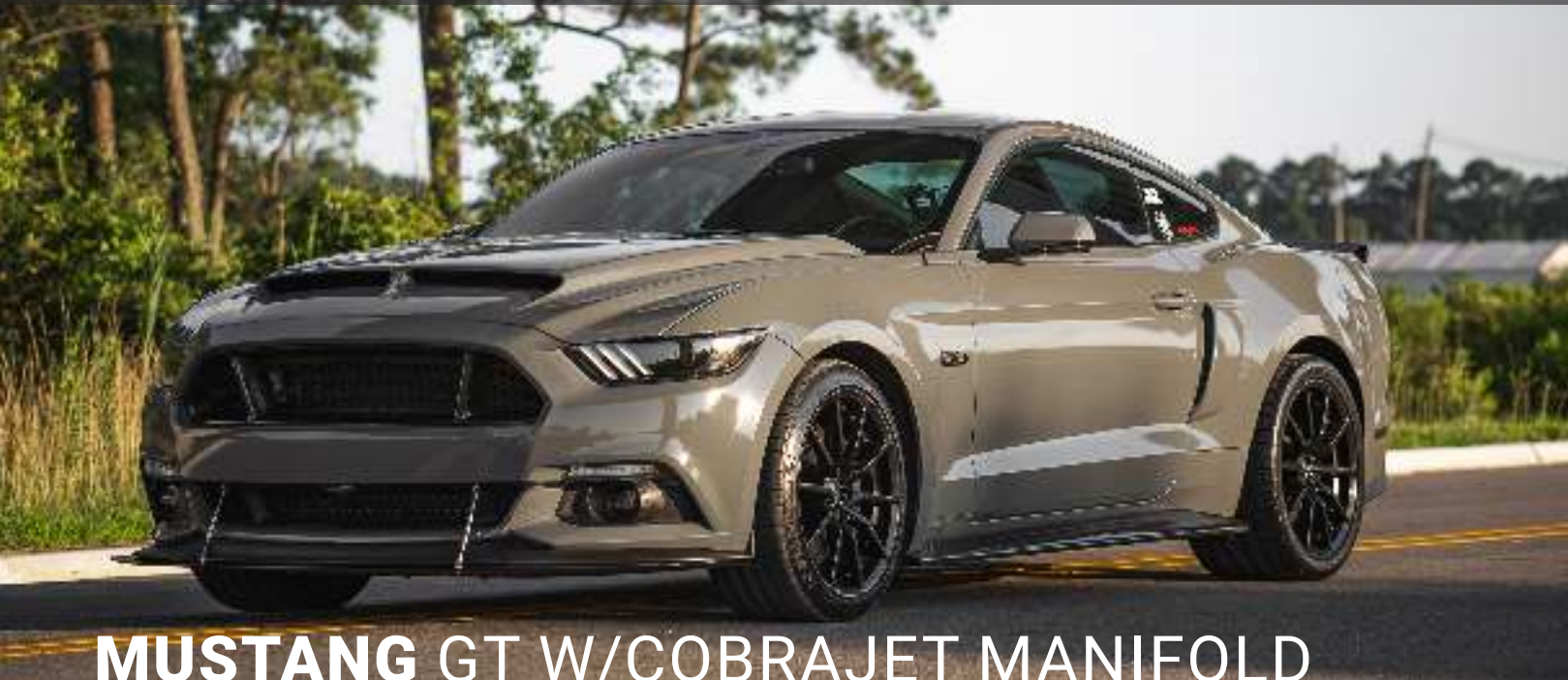
MUSTANG GT W/COBRAJET MANIFOLD