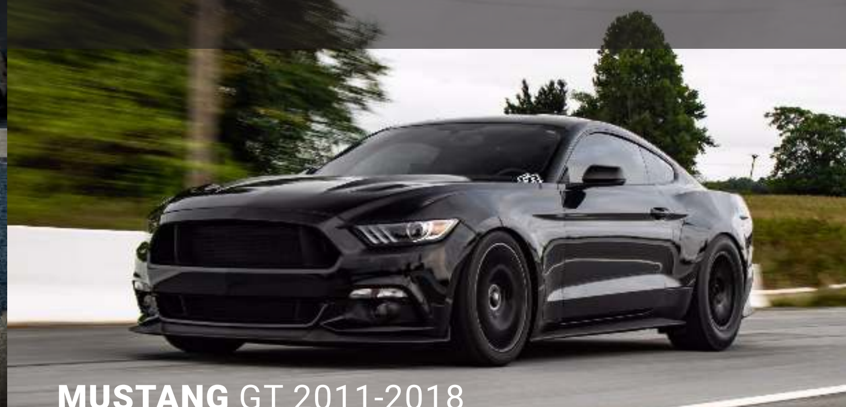
MUSTANG GT 2011-2018