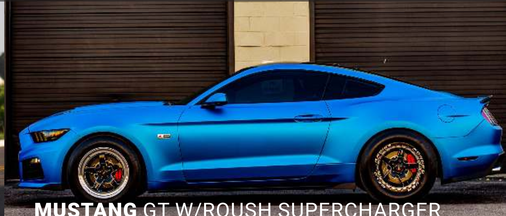
MUSTANG GT W/ROUSH SUPERCHARGER